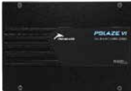
PBlaze6 6920 Series NVMe SSD

PCIe 4.0 , Superb Sustained Performance for I/O-intensive Data Center